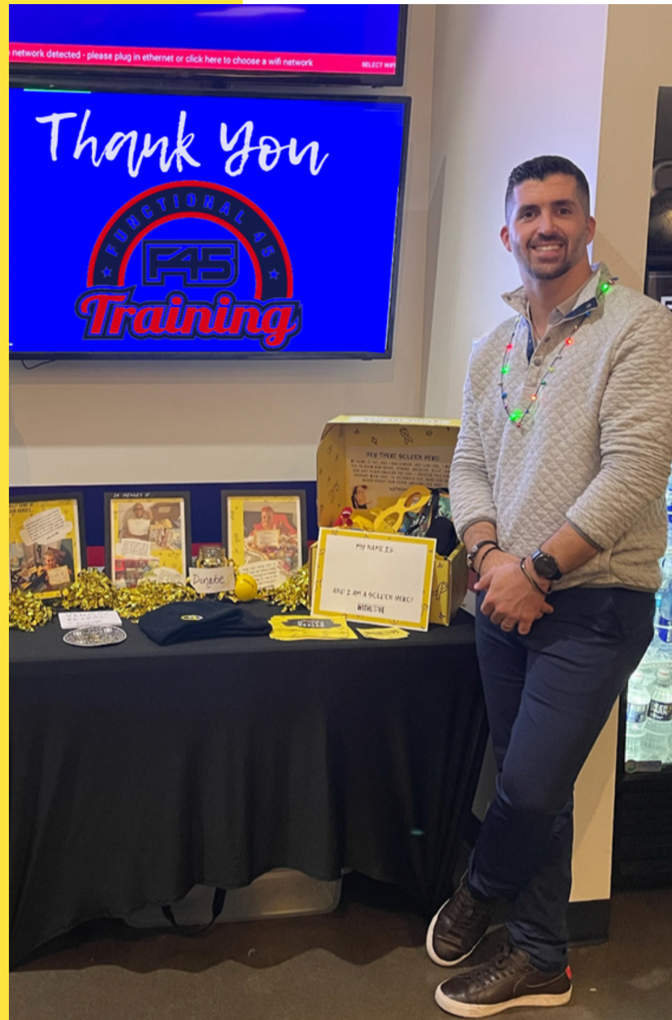
F45 Holiday Happy Hour

Host a fundraiser for WithLove through your company or community event. Local gyms, restaurants, and churches are always excited to get involved in a give-back opportunity. Past fundraiser examples include happy hours, toy drives, sip & shop events, and "workouts for a cause."