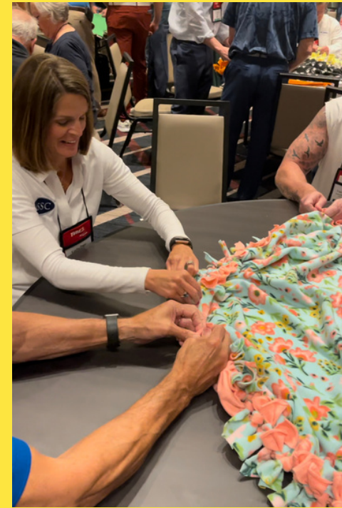
Choose Your Fabrics