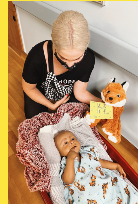
Teddy "Bear" Build