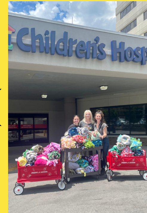
Blankets Dropped Off at Local Children's Treatment Facility