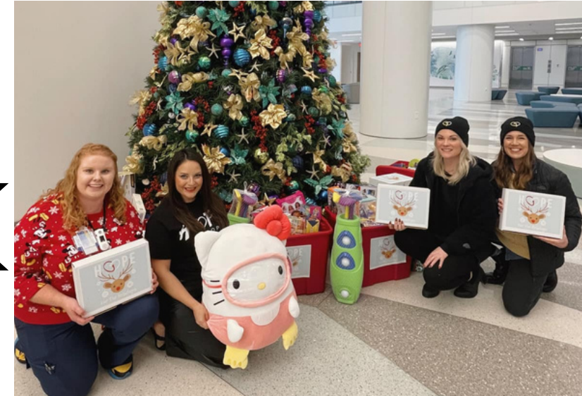
Craft Kits Dropped Off at Local Children's Treatment Facility