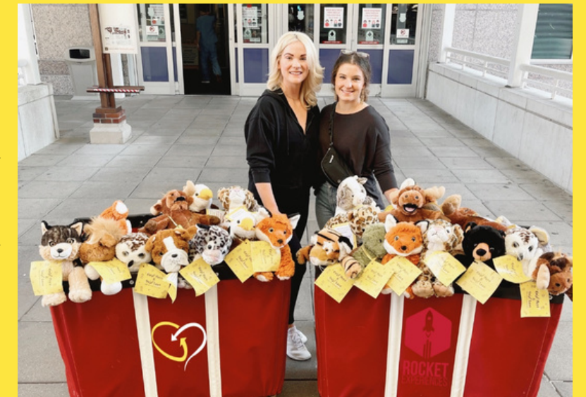
"Bears" Dropped Off at Local Children's Treatment Facility