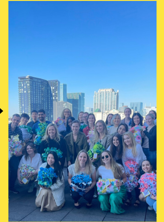
Hand-tie Blankets with Your Team & Sign Tags