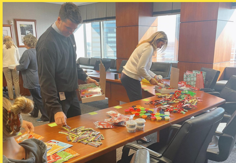
Assembly Line Production with Team