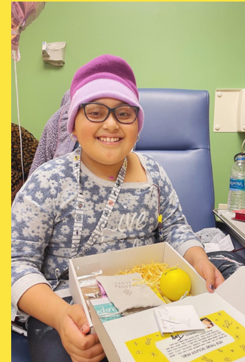
Craft Kit Build