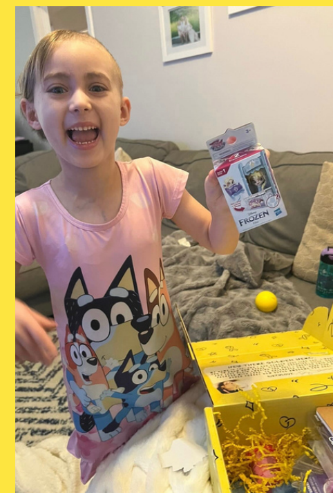
Golden Hero Box Sponsor (Bulk)