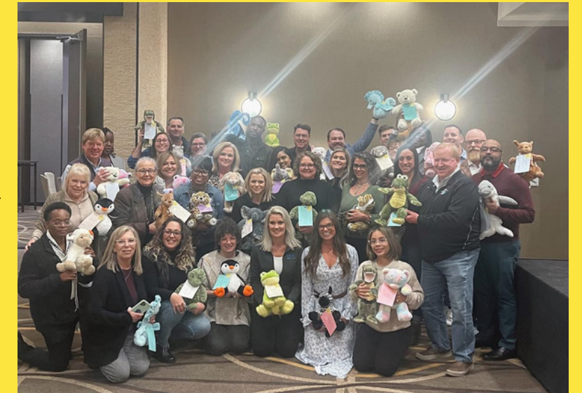
Hand-stuff "Bears" with Your Team & Sign Tags