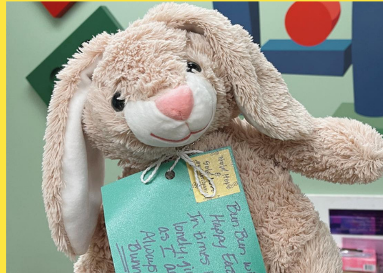
Choose Your Theme